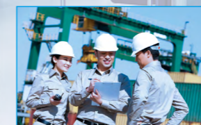
Port & Airport